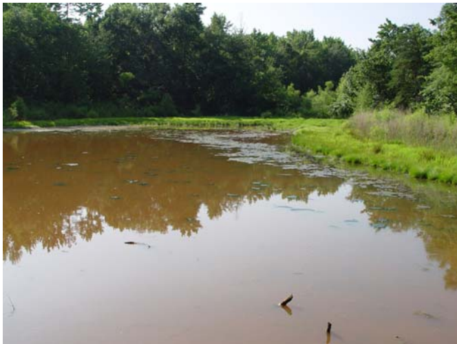
Figure 4: Substantial sun exposure at Wetland 1 in Charlotte, NC, possibly leading to low effluent concentrations of pathogen indicator species.