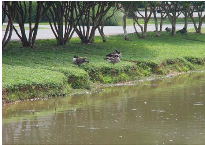
Figure 2: Waterfowl can produce substantial amounts of waste around urban ponds.

rial pollution on ocean and estuarine environments, where pathogens transported in stormwater and polluted streams can persist long enough to be consumed in contaminated shellfish or ingested by swimmers. Thus, there are economic and public safety concerns when pathogen pollution affects shellfish waters and recreational beaches (Figures 3a and 3b). For instance, according to the North Carolina Division of Marine Fisheries, over 33 million pounds of shellfish, valued at more than $32 million, were commercially fished from North Carolina in 2006. Likewise, wa-