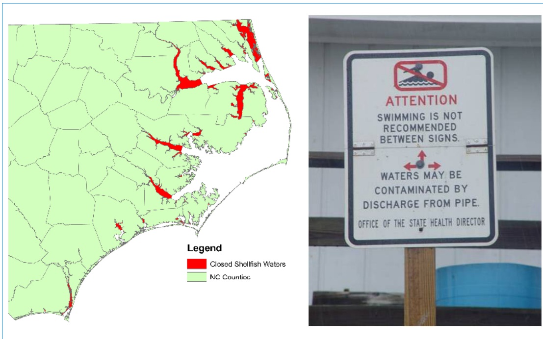
Figure 3: (a) Closed shellfish waters in North Carolina (b) Posted warning sign at North Carolina beach.

can be sources of pathogens. BMPs can attract wildlife including deer, waterfowl, rodents, and domestic animals. These animals defecate in and around the BMPs, resulting in direct pathogen inputs to the system. Ongoing research is being conducted at N.C. State University and elsewhere to determine if BMP designs can be manipulated to provide or enhance treatment mechanisms and environmental conditions that will stimulate pathogen inactivation and die-off.