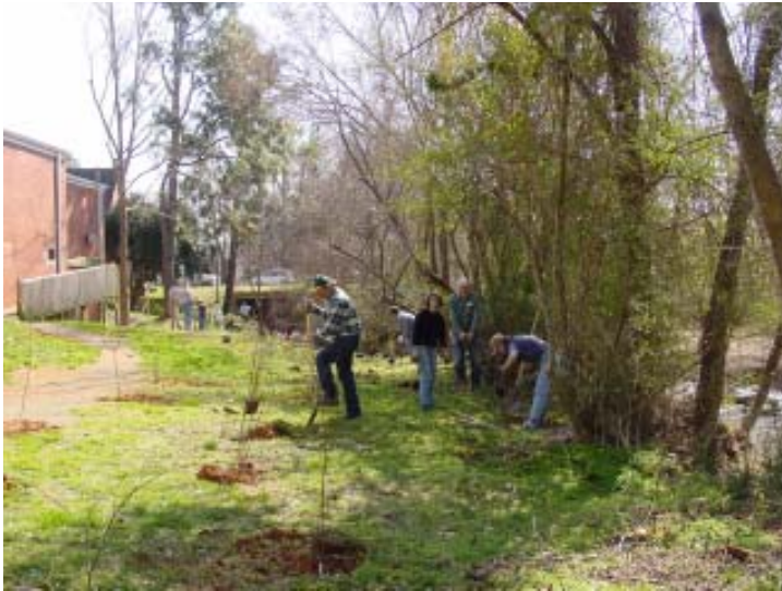
Buffer planting along Little Creek.

planted trees. The planting went quickly; in less than 2 hours over 200 trees and shrubs were given new streamside homes.