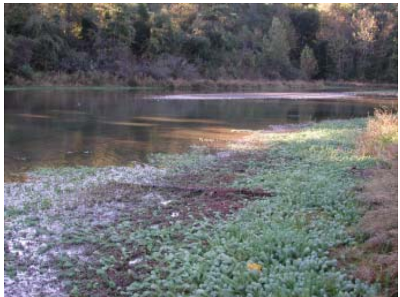
Parrot Feather infestation along Town Lake.

Town Lake, also known as Pittsboro Lake, is located in the town limits of Pittsboro. This 38-acre lake impounds Robeson Creek and previously served as a water supply for the town. Due to an aquatic weed problem, namely, parrot feather ( Myriophyllum aquaticum ), the lake is on the NC