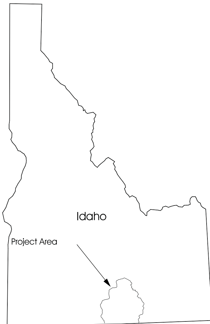
Figure 9: Eastern Snake River Plain (Idaho) Demonstration Project Area Location